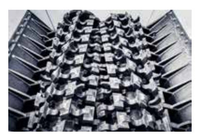
Output: 100-200 mm